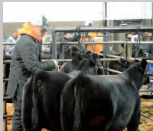
►Above: Sale heifers get spruced up for the crowd in attendance at the “Angus Night on the Mountain” fundraising event and cattle sale.